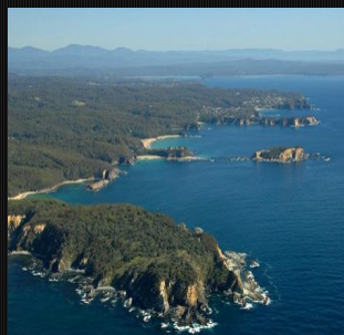
Burrewarra Point South Coast NSW