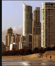
Gold Coast QLD Development in 1930 Gold Coast QLD Development in 2007

(Source: Insurance Council of Australia 2008, Improving Community Resilience to Extreme Weather Events, p.4)